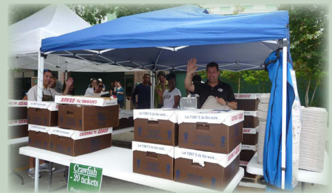
(pictured below) Parents and volunteers from Tony's Seafood help prepare plates of crawfish to be sold at the event.